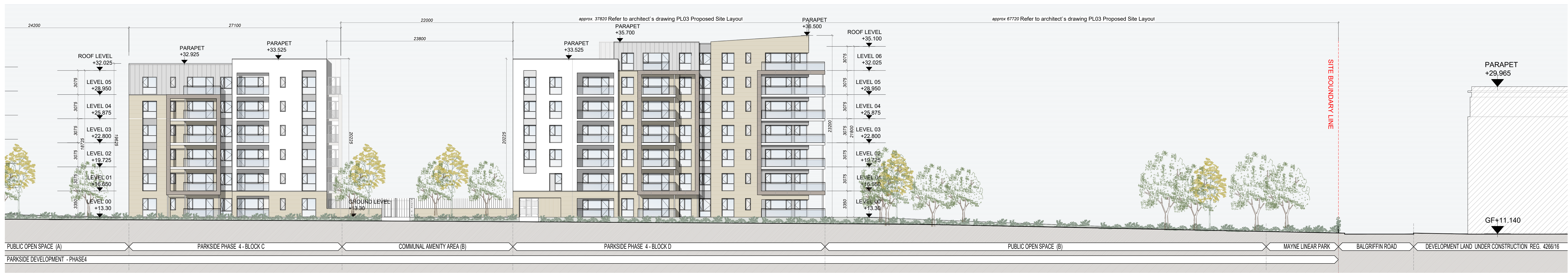
ELEVATION 01 - SITE CONTEXT ELEVATION SOUTH 1:200